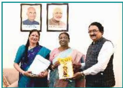
H.E. Hon'ble Smt. Droupadi Murmu Ji President of India

Founder President & Chairman, Suryadatta Education Foundation