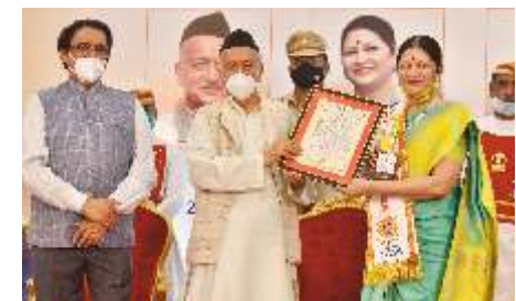
Hon'ble Shri. Bhagat Singh Koshyari, Governor of Maharashtra Conferring Suryadatta Stree-Shakti Puraskar

Suryadatta Stree Shakti Rashtriya Puraskar" are bestowed by Suryadatta Education Foundations Suryadatta Group of Institutes every year, at the hands of eminent & exemplary stalwarts.