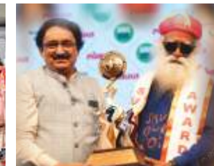
Felicitation of Padma Vibhushan Hon'ble Sadhaguru Jagadish Vasudev Founder - Isha Foundation