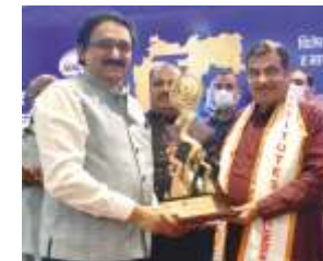
Felicitation of Hon'ble Shri Nitin Gadkari, Minister of Road Transport and Highways of India

Each of its institutions has carved a niche for itself and are ISO 9001 : 2015 Certified Institutes and Accredited by ANAB, USA (Member of IAF) by NVT-QC is rated highly within its segment and its flagship institutes are NAAC accredited.