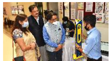
A Startup display during annual Startup Fest 2021

To give wings to the dreams of aspiring, young students with an entrepreneurial orientation, centres of excellence in the form of AIMA Biz Lab, Innovation Nxt lab, A.I. Lab have been established to strengthen the startup culture on the campus. Constituent units of SGI operate innovation and incubation cells and organize Start-up fests, learning sessions, design thinking workshops, Business idea competitions, IPR seminars, Hackathons and similar events to identify and nurture the entrepreneurial talent of SGI. Suryadatta also has institutionalized a tinkering lab for school students.