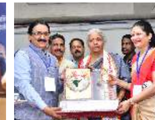
Felicitation of Hon'ble Smt. Nirmala Sitaraman, Minister of Finance of India