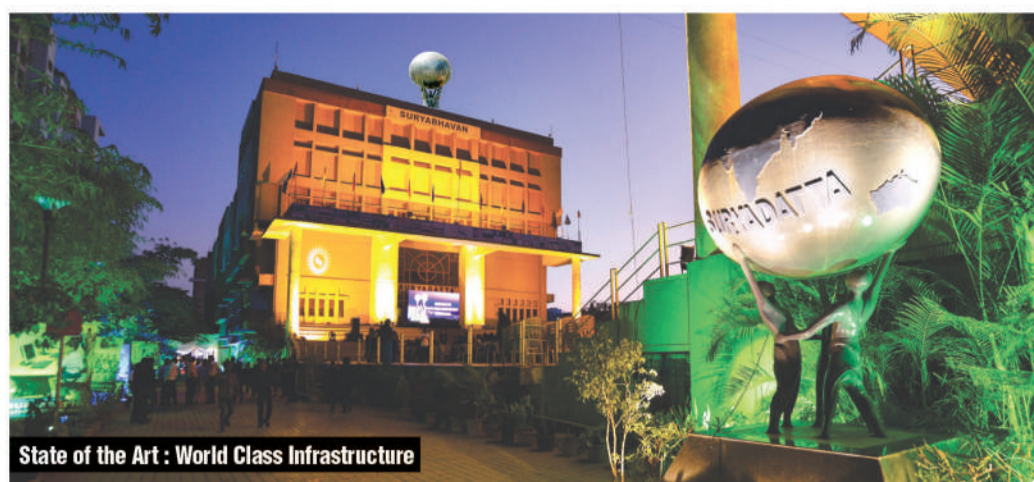
State of the Art : World Class Infrastructure