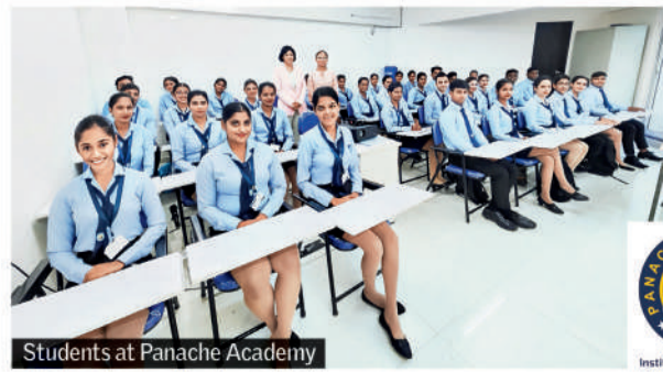
Students at Panache Academy

Elaborating the vision of the institute, Khushnum Avari says, "We provide quality and industry-relevant training programs that equip students with the expertise and confidence to excel in their chosen careers in the aviation, hospitality, and travel sectors. To nurture a conducive learning environment, we offer comprehensive practical training and hands-on experiences, enabling students to bridge the gap between theory and practical."