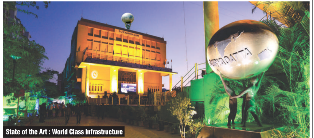
State of the Art : World Class Infrastructure